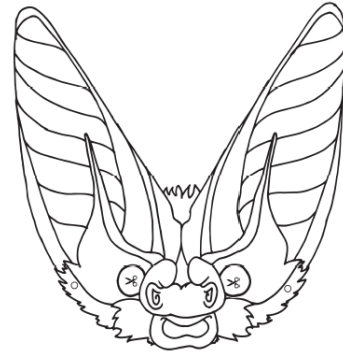
TOWNSEND BIG EARED BAT